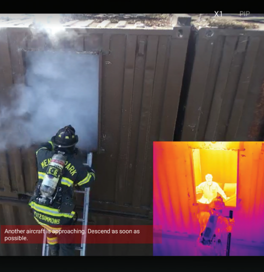
Another aircraft is approaching. Descend as soon as possible.