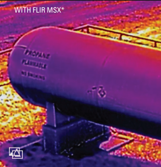
WITH FLIR MSX*